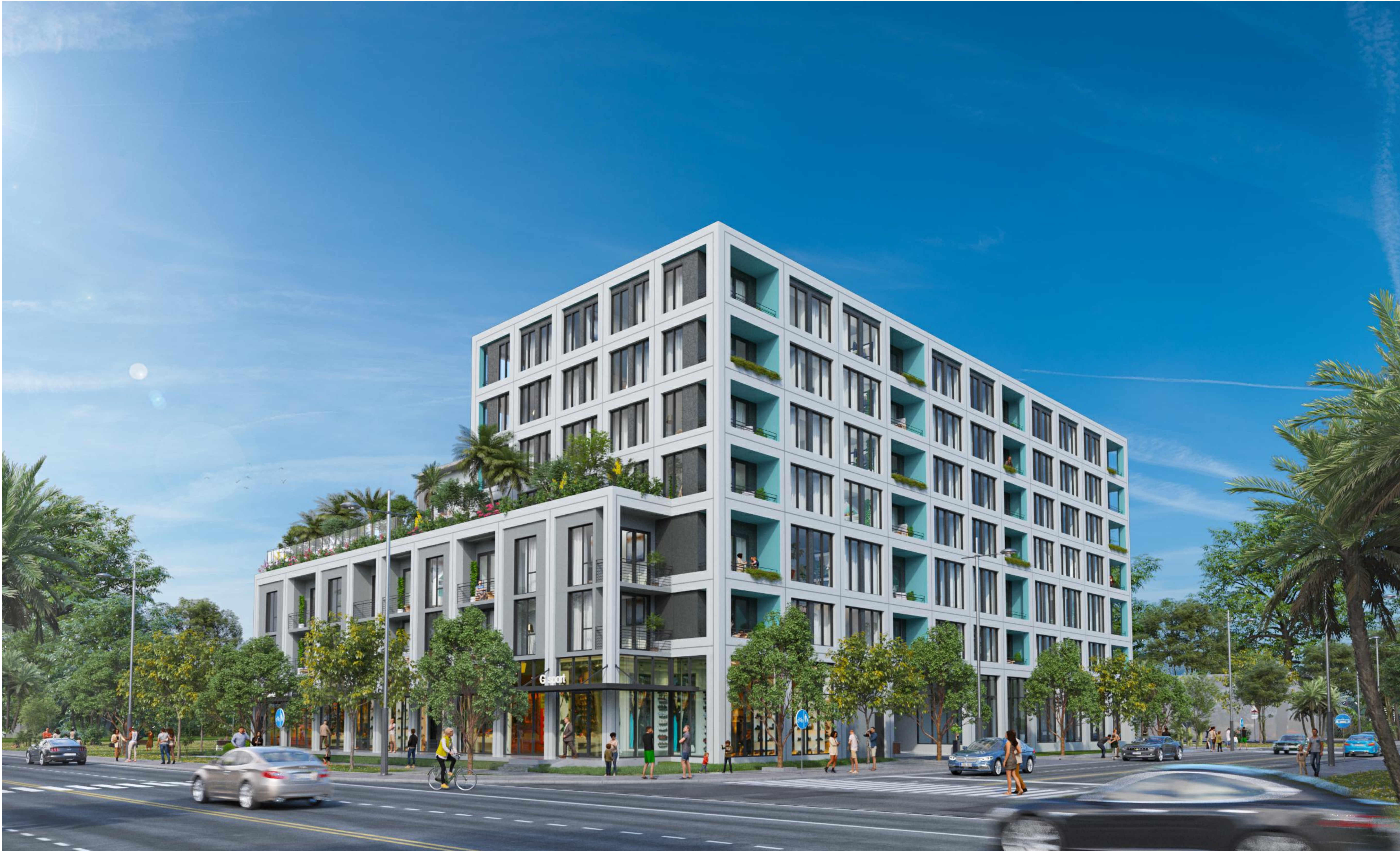
3D RENDERING -SOUTHWEST VIEW (FRONTING FEDERAL HIGHWAY AND NE 2ND ST.)